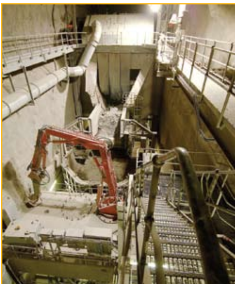
Underground crusher with rock breaker.

While the AutoMine system directs how mining takes place and the equipment operations, PCBC uses mining and geotechnical parameters to propagate