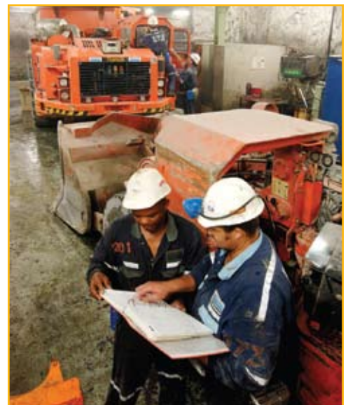
Day to day production with automated trucks.