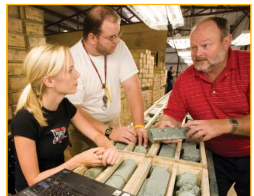
Shore Gold team examining core samples.