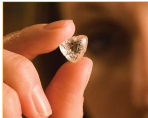
Close-up view of recovered diamond.

For more information email info@gemcomsoftware.com