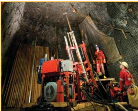
Underground blast preparation.