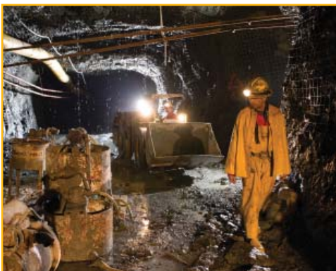
Workers traverse an underground tunnel.

aid future diamond mining, production and scheduling.