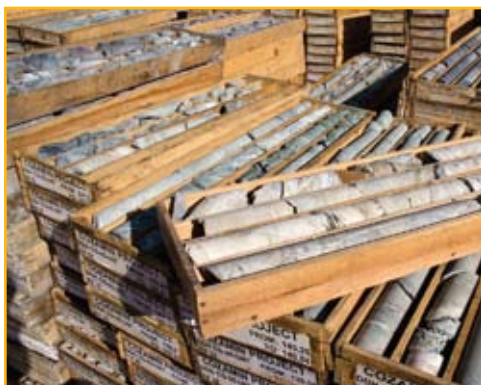
In 2007, Capstone completed 25,000m of surface and underground exploration and infill drilling to upgrade and expand its resource base.