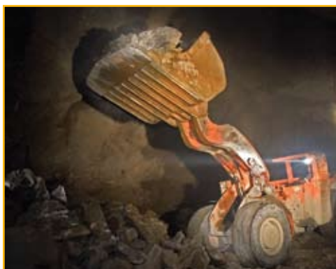
Loading out Cu-Ag-Pb-Zn ore from the Cozamin mine.

deployed Surpac and Surpac Xplorpac Edition. As Capstone’s mining software standard, Surpac offers a wide range of functional tools, and its modular and easily customisable design gives the company the option of purchasing the components they need now and adding others later. This aspect also reinforced Capstone’s decision to standardise on Surpac. “Being able to purchase the modules that are appropriate for our use at this time keeps our software budget under control,” Stone says.