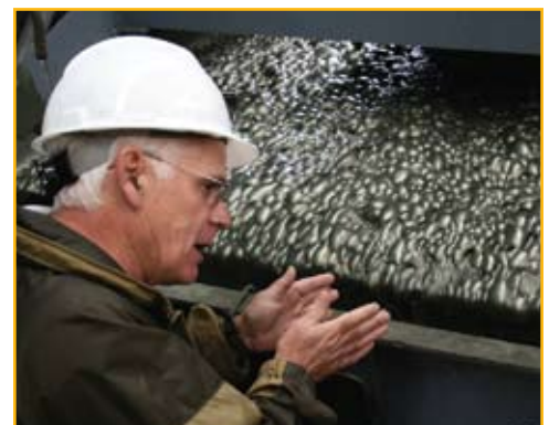
Copper, lead and zinc concentrates are produced at Cozamin and shipped overseas from Manzanillo.