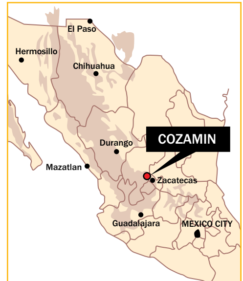
Cozamin is situated on top of the 5.5 km long Mala Noche vein in Zacatecas, Mexico.

Capstone has a comprehensive Surpac license, which Stone uses, and Gemcom Surpac Xplorpac Edition, which gives Cozamin staff practical tools for drill-hole display, three-dimensional (3-D) graphics and blast design. Silverstone also