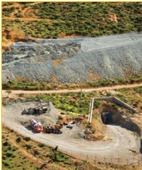
Vehicle access to the Cozamin mine is through the San Ernesto portal.