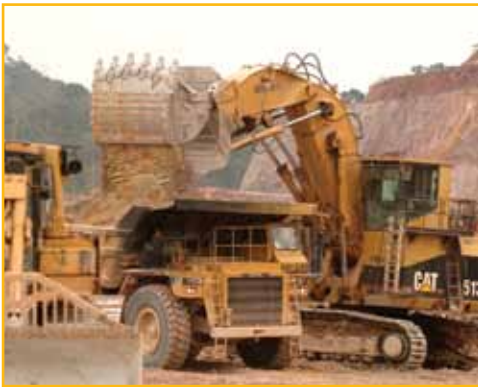
Shovel and haul truck in Pay Caro pit.