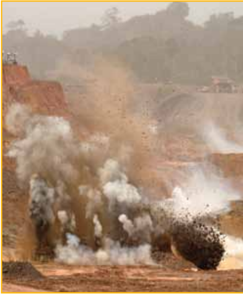
Blast on the Pay Caro pit.