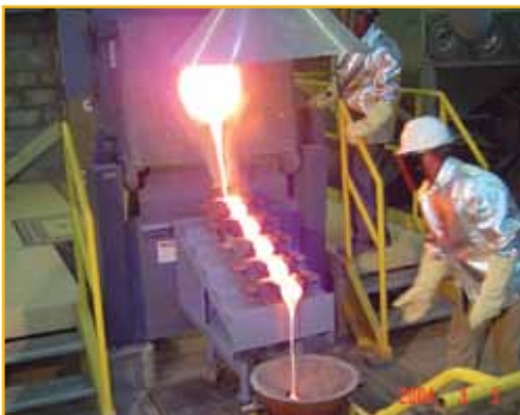
Rosebel processing plant.

Many Chilean job candidates who have sought employment recently at IAMGOLD are familiar with GEMS, so the company expects to tap from this pool of skilled employees when it expands further in South America.