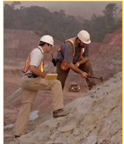
Geologists working in the Pay Caro pit.