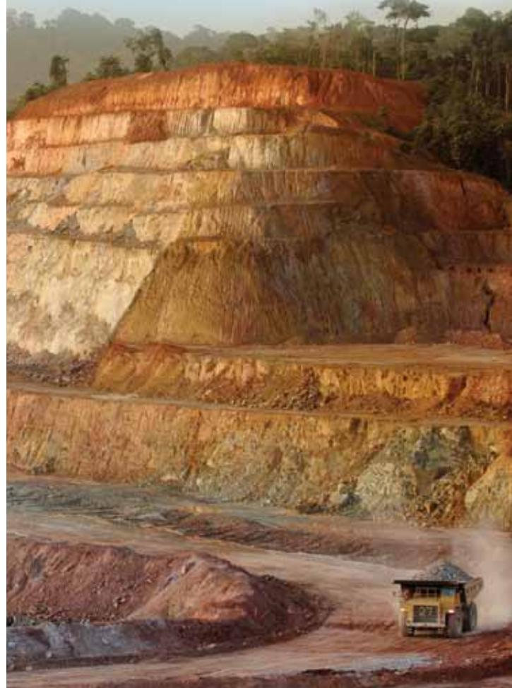
Rosebel Mine, Suriname