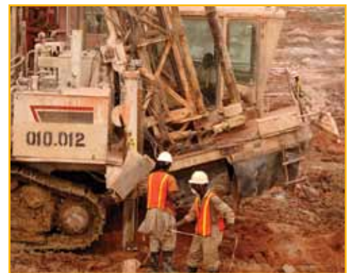
Pit drillers in Pay Caro pit.