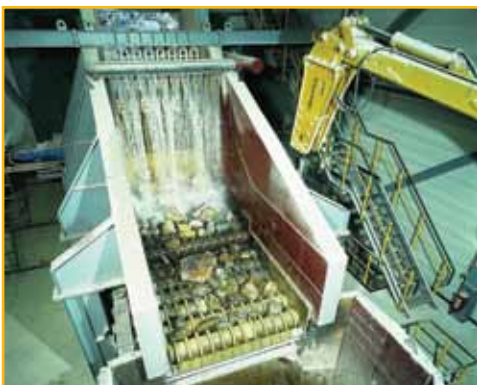
Pre-screening at the Wülfrath-Flandersbach plant.

training and technical assistance in the German language. Gemcom also commits to ongoing research and development with regular product updates and enhancements. These were important considerations in Rheinkalk’s purchasing decision.