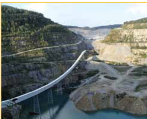
Conveyor belt between the Rohdenhaus crusher and washing plant.