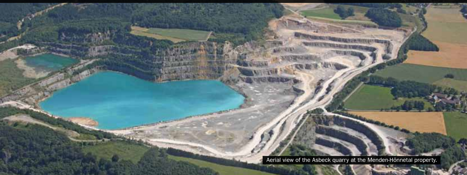
Aerial view of the Asbeck quarry at the Menden-Hönnetal property.