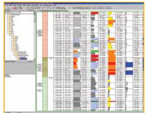
Surpac's Graphical Log feature summarising down-hole drill data.